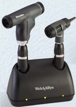
71814-MPS Desk Charger Set (UK)