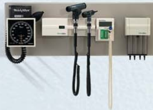
76791-4MP4 Integrated Diagnostic System (UK) 76791-2MP2 Integrated Diagnostic System (SA and Europe)